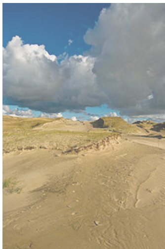
Curonian "Nerija" sand dunes