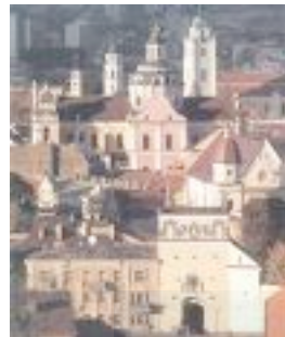
Gediminas castle, Vilnius