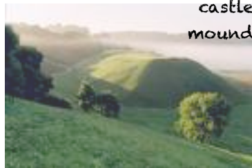
Kernavė castle mound